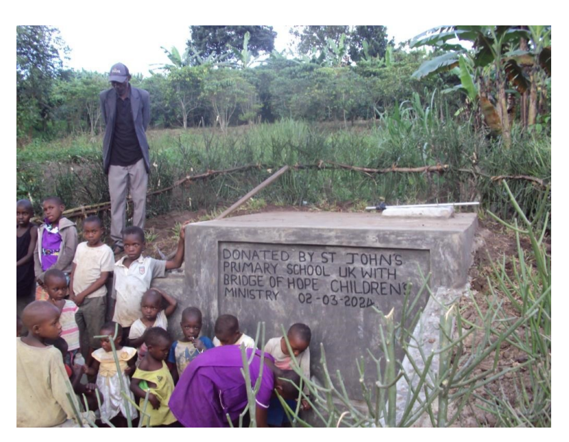
"Bridge Of Hope Children's Ministry" supporting orphans in Uganda.

The school has agreed to raise £1,400 to cover the costs of this, so far we have raised £506.09 If you would like to make a donation, please go to ParentPay where there is a donation account set up—Protected spring Uganda. We will be holding fundraising days.